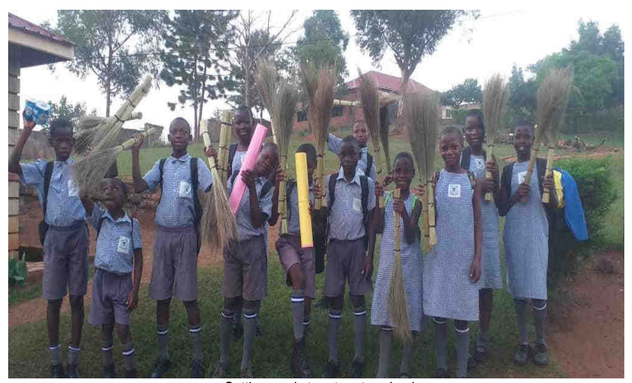
Getting ready to return to school

We still need to raise funds for the purchase of solar panels for the boys' house, a new desktop PC, a TV for the boy's house, harvesting rainwater or drilling a borehole to get free water from underground, funds to plaster the exterior of the girls' house to give it more life and purchase of a Tukutuku mode of transport to help staff to carry grass and maize brand and other feeds for the animals, turkeys and chickens we are rearing.